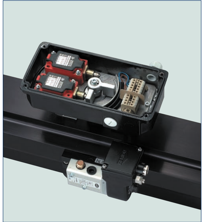
Pneumatic Quarter Turn Actuator (spring returned) with Switchbox MSK (Size II). Integrated mechanical limit switches. Support acc. to VDI/VDE 3845. Pilot solenoid valve for single acting pneumatic actuators.